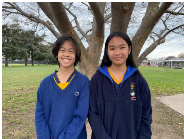
Head Girl and Head Boy 2022