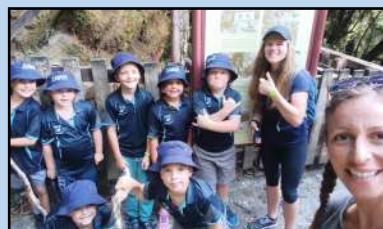
Franz Wild Life Visit