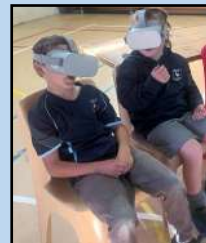
Climate change Otago Uni