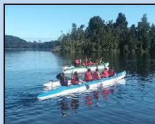
Waka Ama Visit